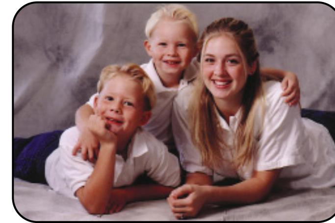
For your family's health... The solution to indoor pollution. * Photography by The Portrait Event

Compounds react with ozone in a process similar to combustion. The reaction of an organic compound with ozone and the combustion of the same compound yield carbon dioxide and water as the main end product.