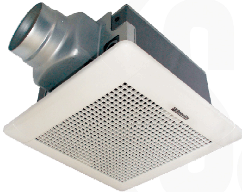
V50 V80 V110