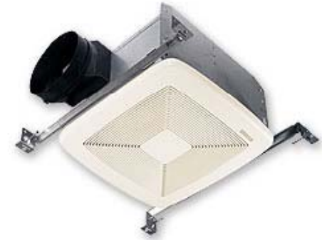
Broan Ultra Silent